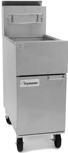
ESG35T Shown with optional casters.