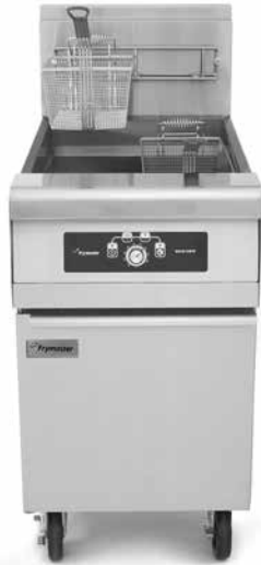
Shown with optional analog controller and casters