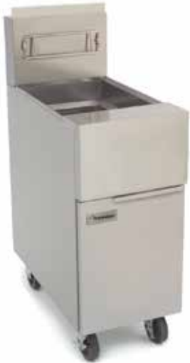
GF40 Shown with optional casters